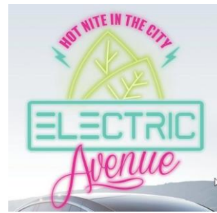
Kamloops Electric Vehicle Owners